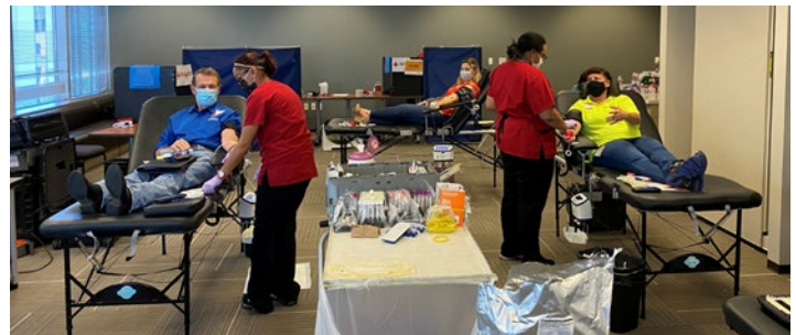
Gust Rosenfeld partnered with the American Red Cross by hosting a blood drive with staff and attorneys.